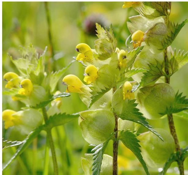
Image: Yellow Rattle in flower