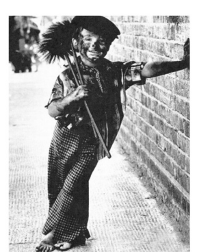
It is against company policy to employ small children

Fully insured for professional sweeping of solid fuel appliances and open fires. Certifate issued for insurance purposes. CCTV surveys if required.