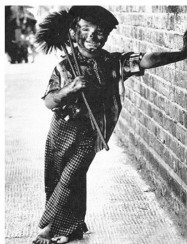
It is against company policy to employ small children

Fully insured for professional sweeping of solid fuel appliances and open fires. Certificate issued for insurance purposes. CCTV surveys if required.